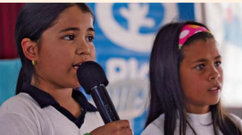
Girls from a child rights group, Paraguay.

Plan International Headquarters Chobham House, Christchurch Way, Woking, Surrey GU21 6JG. Tel: +44 (0) 1483 755155 Fax: +44 (0) 1483 756505 email: campaigns@plan-international.org