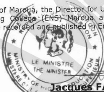
Jacques FAME NDONGO MINISTER OF HIGHER EDUCATION

Article 13 : The Rector of the University of Maroua, the Director for University Accreditations and Quality and the Director of the Higher Teachers' Training College (ENS) Maroua are, each in his sphere, charged with the implementation of this order which shall be recorded and published in English and in French wherever need arises.