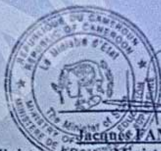
Jacques FAME NDONGO, Minister of State, Minister of Higher Education

This press release shall be registered and published wherever necessary